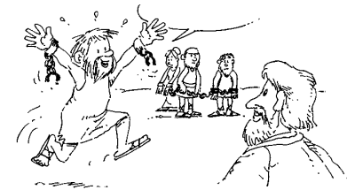
A I have redeemed him (set him free)