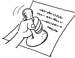
B I will seal this