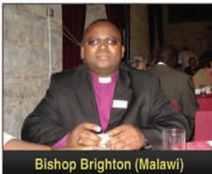
Bishop Brighton (Malawi)